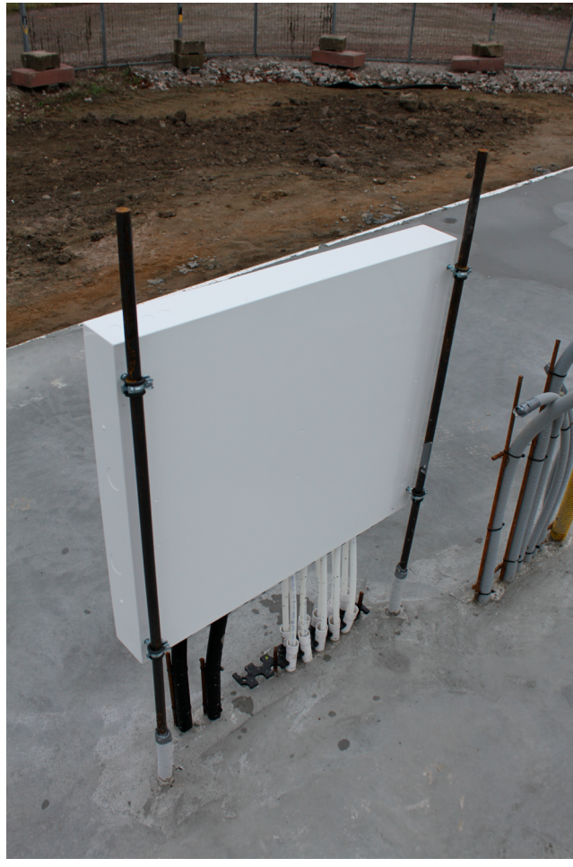
Mounted cabinet stand.