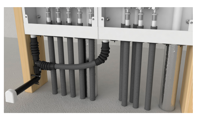
Connection of drainage pipes

It is possible to connect drainage pipes from two cabinets. The illustration below shows side-by-side installation but drainage pipes can also be connected when the cabinets are mounted further apart Use LK Drainage Kit 25 Duo. Fix the drainage elbow to a wall stud in a suitable position. Insert the two installation screws supplied in any of the fixing holes. Ensure that the entire lenght of the conduit is installed sloping downwards towards the outlet and that the conduit is secured.