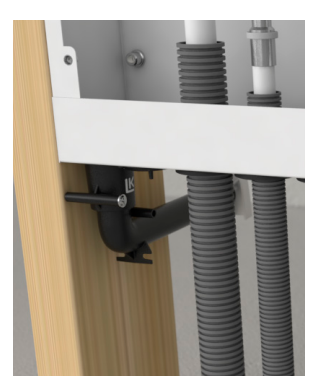
A drainage elbow directly connected to the cabinet's outlet pipe will drain into the same room as the cabinet's service hatch or, alternatively, the room behind.