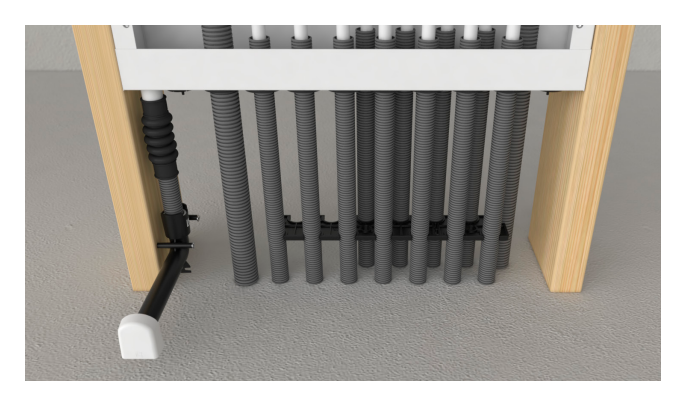
Drainage elbow connected via a conduit.

Connect the conduit to the cabinet's drainage pipe using the bellow sleeve. The bellow sleeve must not be deformed in a manner that prevents the flow of any water leaks. Connect the drainage elbow to the conduit. Note that the pipe should rest in the drainage elbow at a depth of approximately 20 mm. Fix the drainage elbow to a wall stud in a suitable position. Insert the two installation screws supplied in any of the fixing holes. Ensure that the entire length of the conduit is installed sloping downwards towards the outlet and that the conduit is secured.