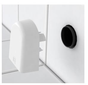
Installation of the LK Outlet Plate V2.

Install the LK Outlet Plate V2 in the outlet pipe. For a more luxurious finish, the LK Outlet Plate V2 Chrome is available as an accessory.