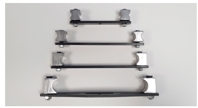
Crossbars, 4 pcs.