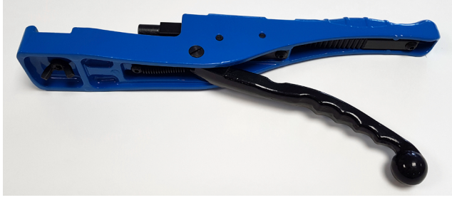
Main unit with handle and lever, 1 pc.