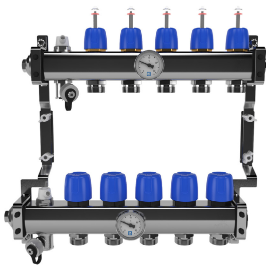
LK Manifold RF, as delivered.