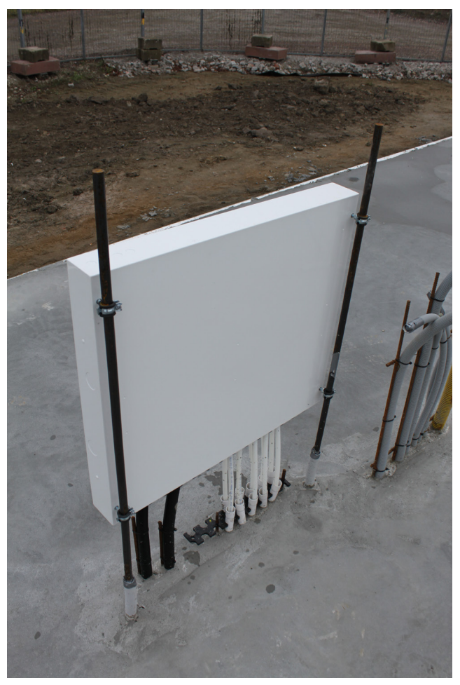
Mounted cabinet stand.