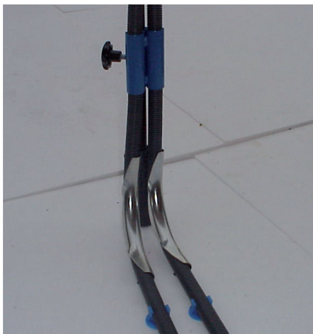
The picture shows assembly with a double LK Pipe Pole, together with LK Pipe Bending Support PL 25 and LK Conduit 20-25.