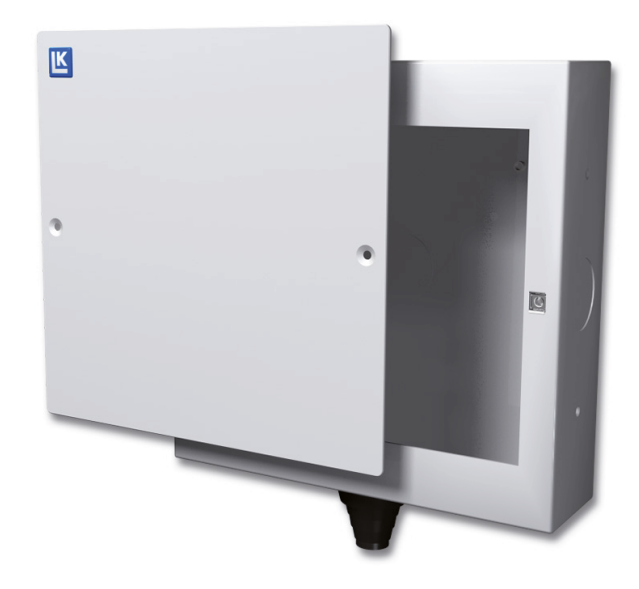
LK Fitting Cabinet VUK.