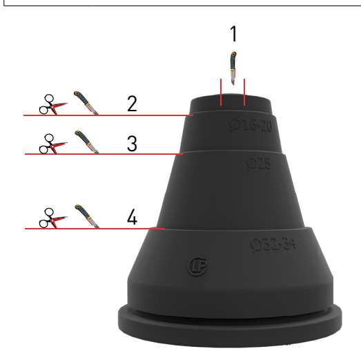
Cutting of a LK Pipe Inlet 20-25 LP.

If the seal is damaged while being cut, it must be replaced with a new one.