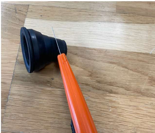
Cutting of a LK Pipe Inlet 20-25 LP . It must be adapted to the copper pipe of the outdoor tap/faucet.