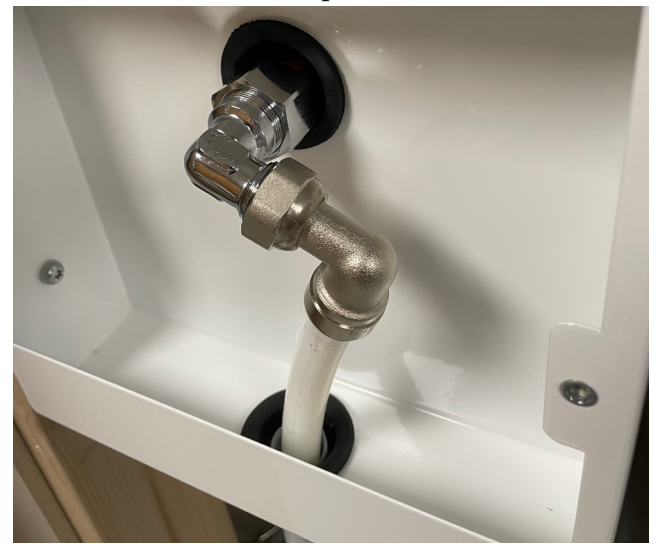
An example of an assembly that does not cause tension in the coupling.