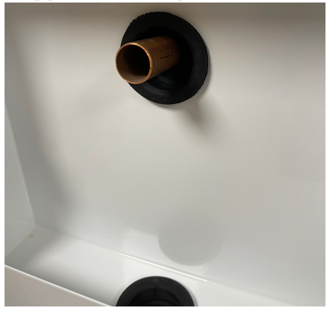
The inside of the cabinet with the pipe inlet and the copper pipe.

8. Fasten the cabinet, with the front on the same level as the interior wall, on load bearing joists or anogging piece using the four enclosed screws.