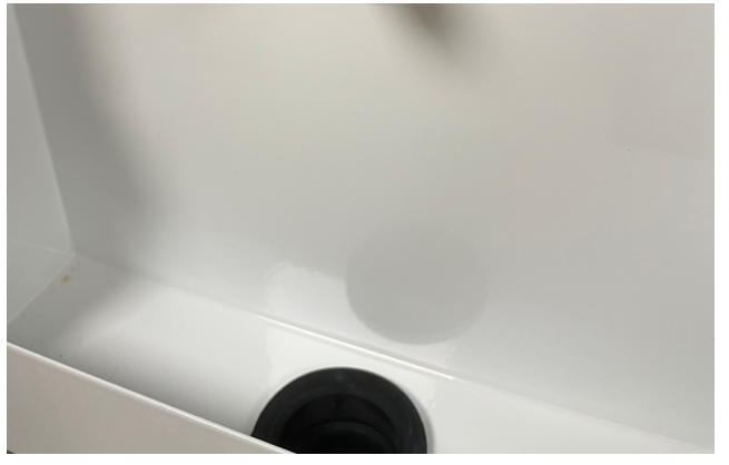
The pipe inlet at the bottom of the inside of the cabinet.

3. Mount the one pipe inlet in the bottom of the cabinet. It should be facing outwards.