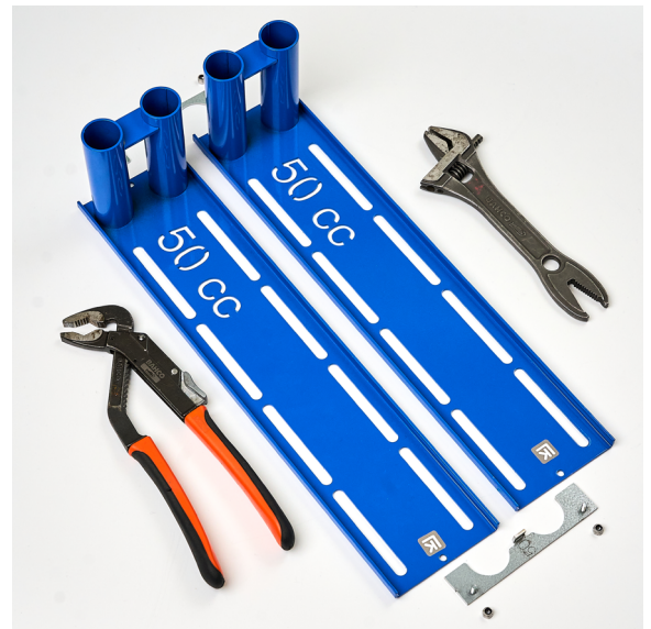
The metal flap is facing upwards. Tools not included.