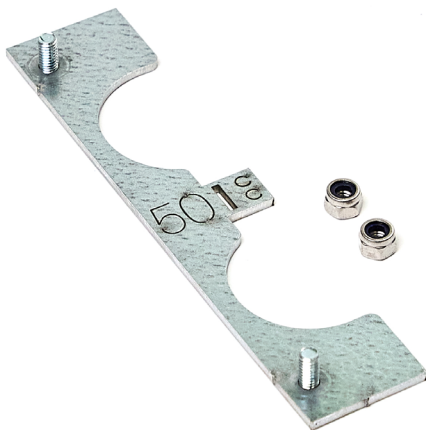
LK Radiator Fixture Spacer with two nuts.